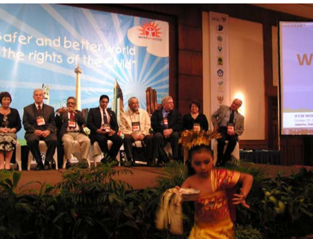
IFCW Executive Committee at IFCW WorldForum 2009