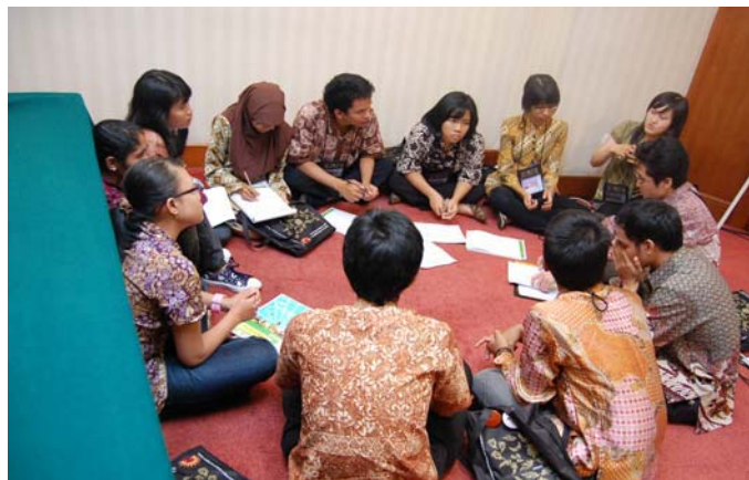
Young people at IFCW WorldForum 2009

The summit marks the 21st annual gathering of the International Forum for Child Welfare (IFCW) and will